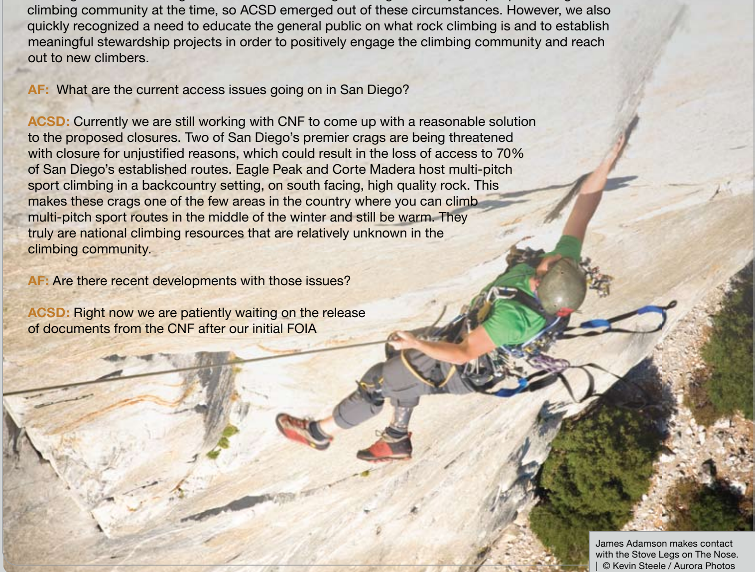
James Adamson makes contact with the Stove Legs on The Nose.

ACSD: Right now we are patiently waiting on the release of documents from the CNF after our initial FOIA