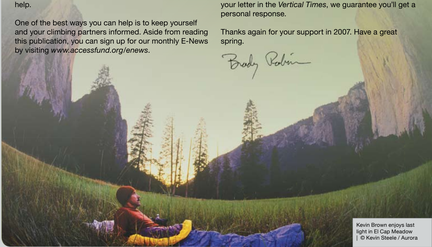
Kevin Brown enjoys last light in El Cap Meadow

Thanks again for your support in 2007. Have a great spring.