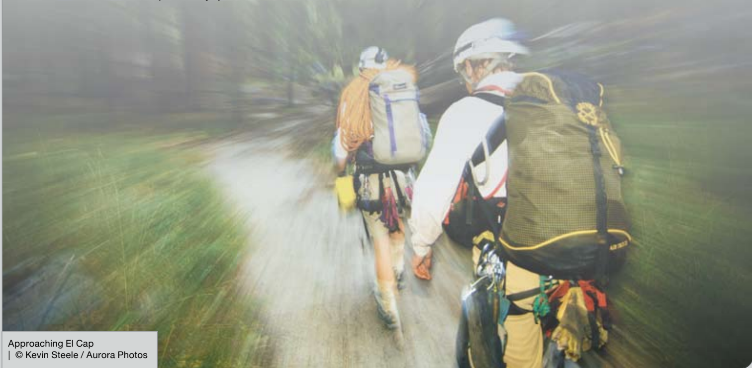
Approaching El Cap

ACSD: If your local community does not have a climbing club or organization, help form one! The more that climbers come together to address access issues as a whole, the more weight we will carry in public land management decisions, specifically around recreational use. It's our job to help educate the public about what climbing is and to help advocate for the climbing community. If your community does have a LCO, join it! Volunteer for them and get involved. And most importantly, join the Access Fund!