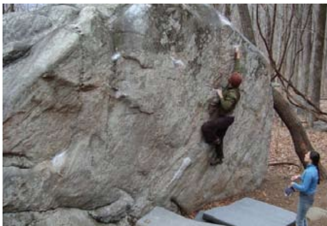
Rumbling Bald West Side Boulders

Then in early December, the Carolina Climbers Coalition (CCC) announced its intent to purchase and conserve the Rumbling Bald West Side Boulders in North Carolina. CCC was granted an AFLCC bridge loan to finance 90% of the purchase price for the 6.12-acre tract. The sale closed in early January, saving the area from private development.