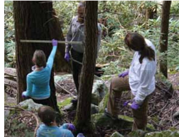
ETCC volunteers treat infected hemlocks

While hemlocks often provide welcome shade to climbers, they're critical to an entire community of flora and fauna, shading and regulating the temperature of their unique habitat. Without the cooling effect of hemlocks, streams would grow too warm for many fish and other aquatic species to survive. Fortunately for the Obed, conservationists are ahead of the curve—threat of the woolly adelgid is present, but it is still early in its infestation. The time was right to head it off before it was too late.