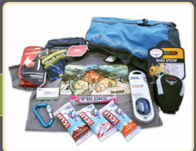
Photo shows the SUPER Holiday Package

Order today at www.accessfund.org/holiday