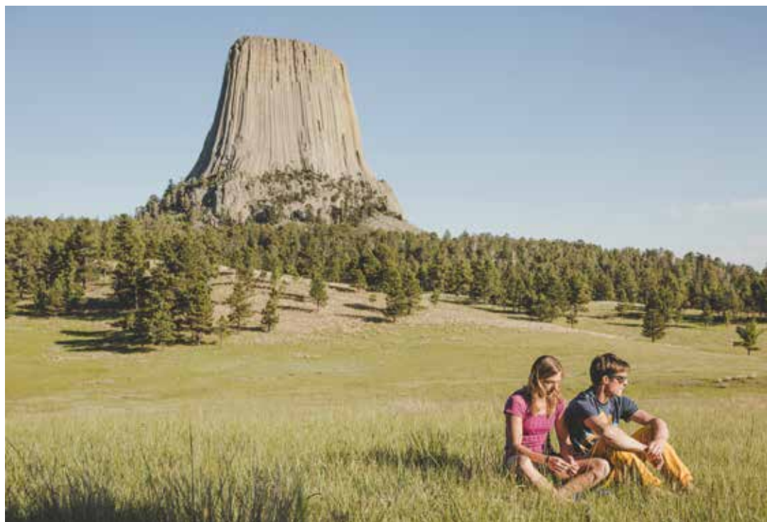
Devils Tower is located on Lakota/Sioux, Cheyenne, Crow, Mandan, Hidatsa, Arikara, Kiowa, Shoshone, and Arapahoe territories.

• Educate yourself. The climbing experience is an amazingly rich one, which is made more so by understanding the human history of the places we climb. Do some research on the indigenous history of your favorite climbing areas, and the next time you're on the approach to your local crag, take a moment to imagine and acknowledge what this place has meant to the hundreds of generations of people who came before us, and what it continues to mean to those who are still there.