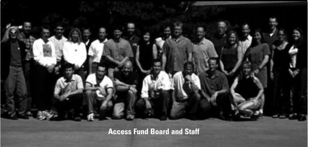
Access Fund Board and Staff