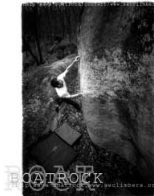
Bouldering at Boat Rock in Atlanta, Georgia is threatened by development.

A 7.7 acre parcel filled with boulders is for sale in Atlanta, GA. The Southeastern Climbers Coalition is in the process of buying the area with the help of several concerned local climbers, The Access Fund and the Trust for Public Land. The price is $100,000 and is located adjacent to a 220-acre parcel that is currently slated for development. This area will be turned into a subdivision if not purchased soon. Check the SEC website for more information at www.seclimbers.org .