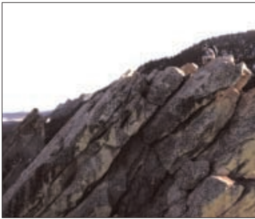
The Flatirons and other cliffs on City of Boulder public lands are host to nesting raptors.