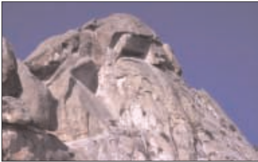
Twin Sisters, Idaho

Just the names of these important climbing areas are enough to inspire any climber. All of these climbing areas are classic in their own right, and face access restrictions by land planning and policy changes, closures due to cultural resources and endangered species issues, and private development. Many of these concerns can be remedied by increased climber involvement and stewardship. The Access Fund has been actively working—in some cases for years—to preserve or restore access to all of these areas. We have identified these areas in this new format to elevate the sense of urgency and commitment among climbers to support our climbing opportunities and protect the aesthetic, historic and natural values of these areas.