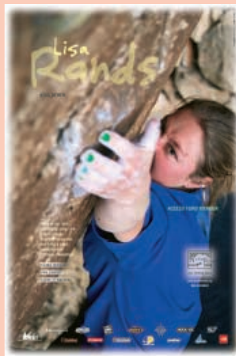
Creative: Ousley