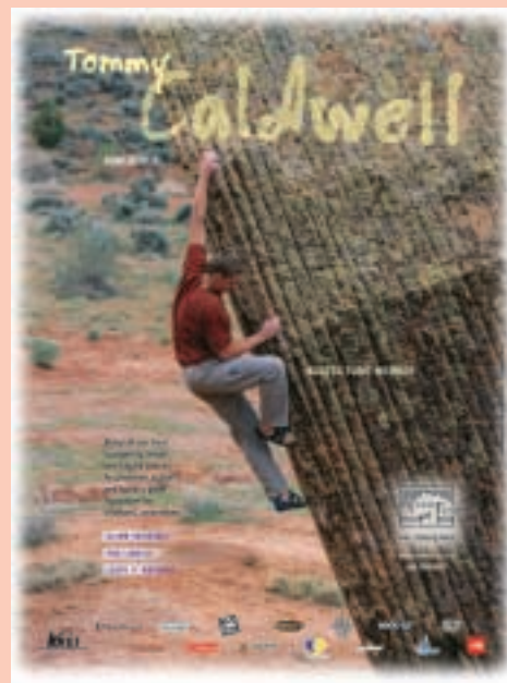
Creative: Ousley