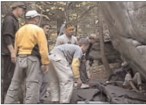
The National Park Service has concerns about increased impact at Grandmother Mountain, NC.

address many issues at climbing areas utilized by camps and schools in the Pisgah National Forest of Western North Carolina. The group's mission is to "Protect the future of climbing areas in the Pisgah Ranger District by addressing issues facing commercial climbing such as group impact, minimizing the impact large groups have on climbing areas, providing trail work, and promoting safe climbing practices.