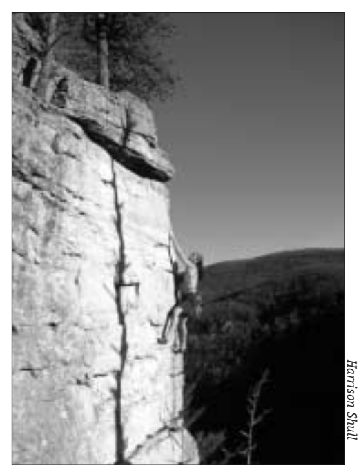
The Obed Wild and Scenic River, Tennessee

The National Park Service has completed an Environmental Assessment and Draft Climbing Management Plan for the Obed Wild and Scenic River. The Obed has become a very popular climbing area with climbers from the Southeast and Midwest, offering high quality sport and trad routes on excellent sandstone. The Access Fund has been working with local climbers and the NPS to prepare this draft plan. The AF supports the Preferred Alternative, with conditions allowing sport climbing within established climbing zones at Lilly Bridge Area and continuing the moratorium on new sport routes until a comprehensive resource study can be completed.