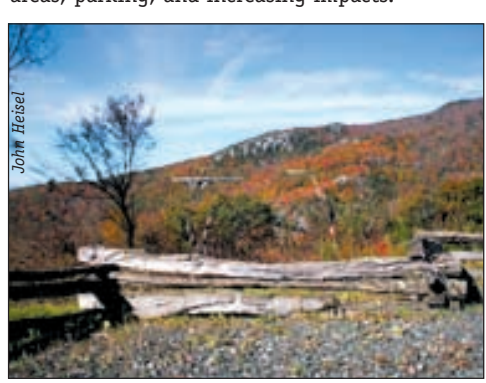
Grandfather Mountain Corridor, North Carolina

Currently, the Boone Climbers' Coalition is assisting the NPS in developing a Climbing Management Plan for the Blue Ridge Parkway/ Grandfather Mountain Corridor. The primary issues include: fixed anchors, endangered flora and fauna, trampling at staging and bouldering areas, parking, and increasing impacts.