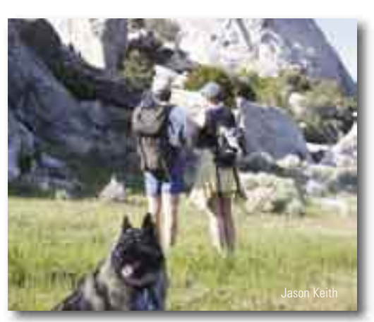
Climbers reaping the benefits of activism and "talking politics" at the newly reopened Castles State Park, Idaho.

As most folks that climb at the City of Rocks know, Castles was a virtually untouched climbing resource located just one valley north of the "City." Although a climbing competition had been held at Castles back in the 1980s, this wonderland of rocks was still private property and off limits until climbers began efforts in 1998 to acquire Castle Rock Ranch and put it into public ownership. A plan materialized: a group of interested parties consisting of The Conservation Fund, the Access Fund and the Idaho Department of Parks and Recreation (IDPR) would buy the ranch with the understanding that the Conservation Fund would temporarily hold title. The Conservation Fund would then sell the property to the National Park Service (NPS) who would then exchange Castles with the state of Idaho for some in-holdings within a national monument a few hundred miles away. For the climbing community, the whole point of this convoluted series of property transfers