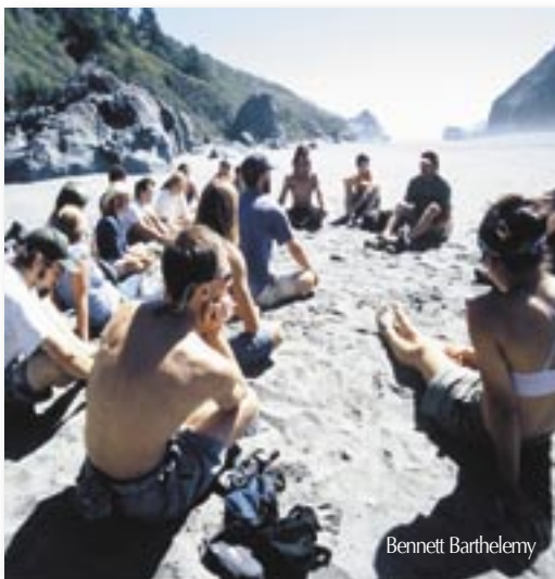
Great Falls, Virginia