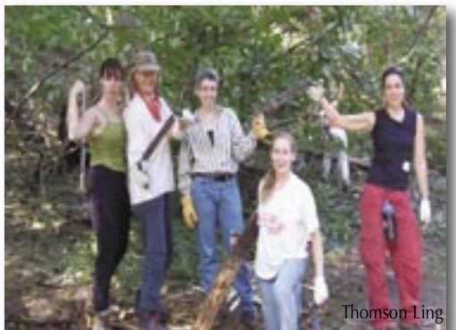
Lumpy Ridge, Colorado