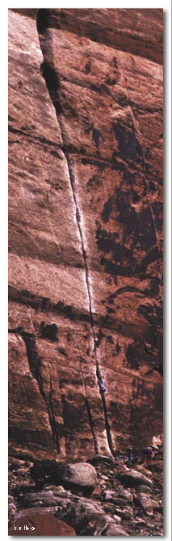
The area around classics such as "Generic Crack" in Donnelly Canyon would be developed according to a formal BLM site plan — the plan may include kiosk installation, new trails, and no charges for use of the area.

The pack-in/pack-out policy would remain in place as long as both the public and BLM think that it is working. If at any time in the future the BLM determines that the pack-in/pack-out policy is no longer effective, permanent restrooms would be installed and fees would be charged to cover the costs of construction and maintenance of the restrooms.