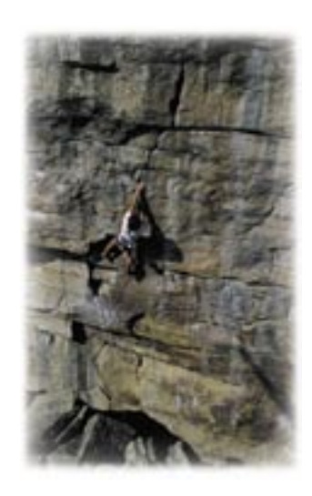
The Access Fund recently awarded the Gunks Climbers Coalition a grant for campground improvements.

Washington Climbers Coalition, WA A grant was awarded to the Washington Climbers Coalition for start-up and orga-