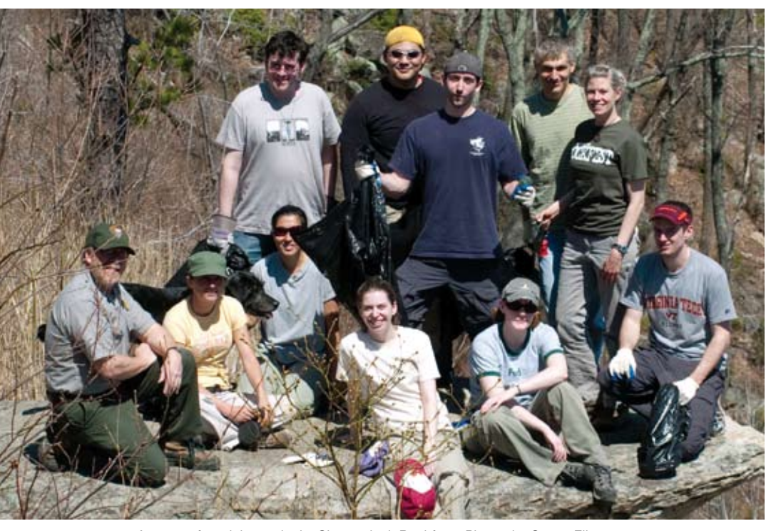
A group of participants in the Shenandoah Rockfest.

It seems the National Park Service agrees. On May 22, the Access Fund received a letter from the superintendent of the National Park Service singing the praises of the Mid-Atlantic Climbers and its volunteers. A special thanks to all of the volunteers and the Shenandoah National Park for hosting such a great event.