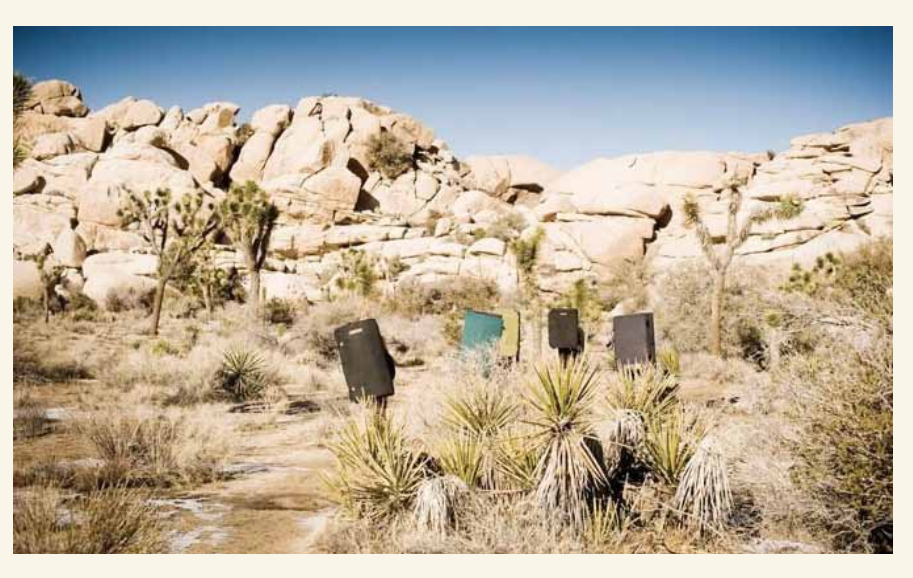
Most of Joshua Tree National Park sits within the Joshua Tree Wilderness, designated by Congress in 1976 and managed by the National Park Service.

While fixed anchors have been at the center of the Wilderness climbing controversy, they aren't the entire story. Other behaviors in Wilderness are also stirring up emotions.