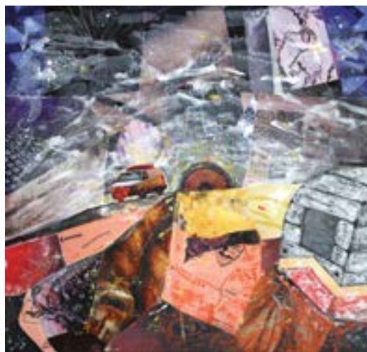
Clockwise: Sunset, Buttermilk Country, mixed media collage | The artist, Vanessa Compton, photo by Sam Davis Photography | Vanna White Aloha Sunrise, Hueco Tanks | © Vanessa Compton