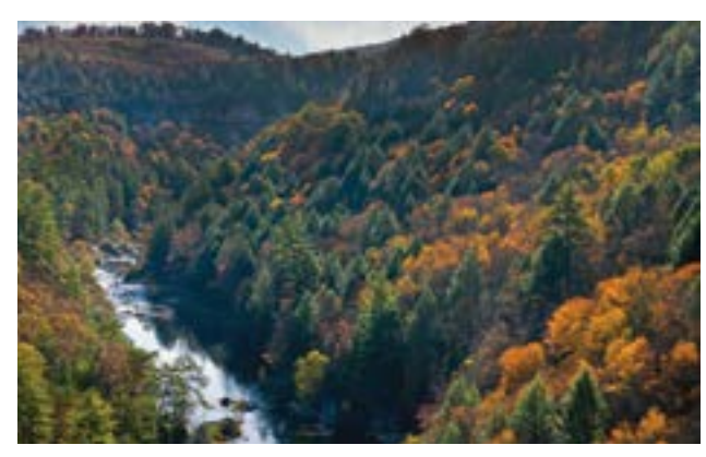
Obed Wild & Scenic River, TN

ACCESS HEROES: East Tennessee Climbers Coalition, National Park Service