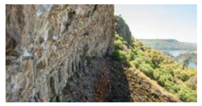
Jailhouse Rock, CA