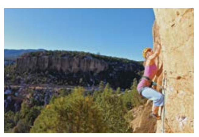
Shelf Road, CO