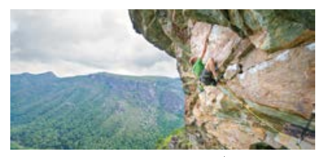
Linville Gorge Wilderness, NC

national policy to replace the ban. Although this process did not reach a consensus, it recommended that climbing be considered an appropriate activity in Wilderness and that some use and placement of fixed anchors is acceptable. The USFS has yet to issue a national-level Wilderness fixed anchor policy (Access Fund continues to work on this issue). However, the BLM and NPS have issued Wilderness policies, based on the negotiated rulemaking recommendations, stating that climbing is an appropriate activity and that occasional use of fixed anchors does not violate the Wilderness Act of 1964.