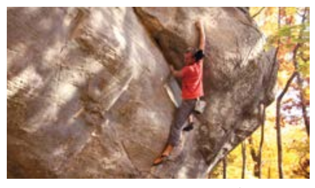
Holy Boulders, IL