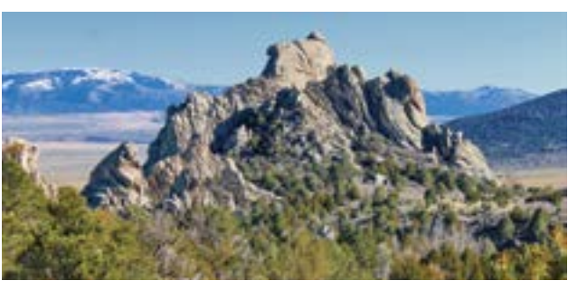
Castle Rocks, ID | © Wallace Keck

ACCESS HEROES: The Conservation Fund, National Park Service, Idaho State Parks