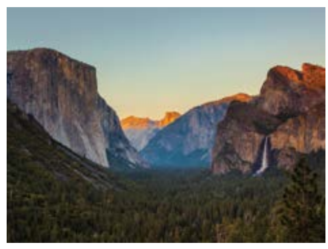
Yosemite, CA