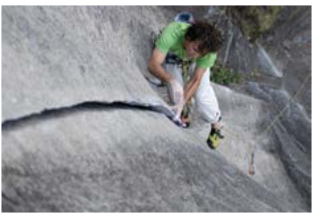
Lower Index Town Wall, WA

ACCESS HEROES: Washington Climbers Coalition, American Alpine Club