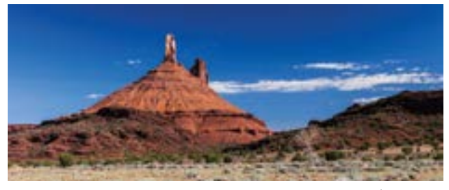
Castleton Tower, UT