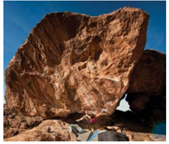
Hueco Tanks, TX