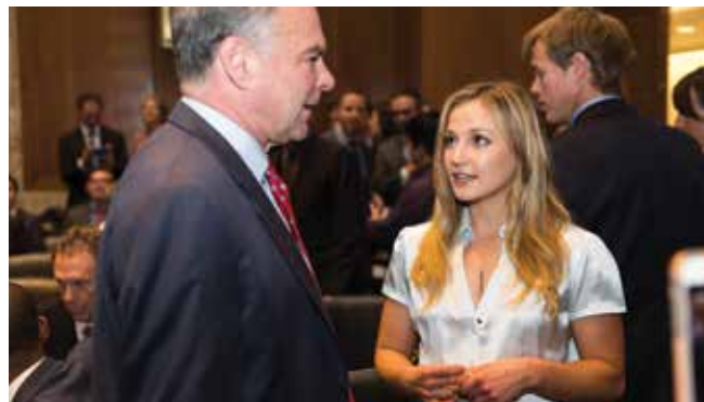
Sasha DiGiulian advocates for climbing at Climb the Hill event.

And speaking out to the general public may serve to inspire more action from the rest of the climbing community as well. At Access Fund, the continued support of many pro climbers, stretching back for decades, helps make the threats to public lands (and what we can all do about it) more visible.