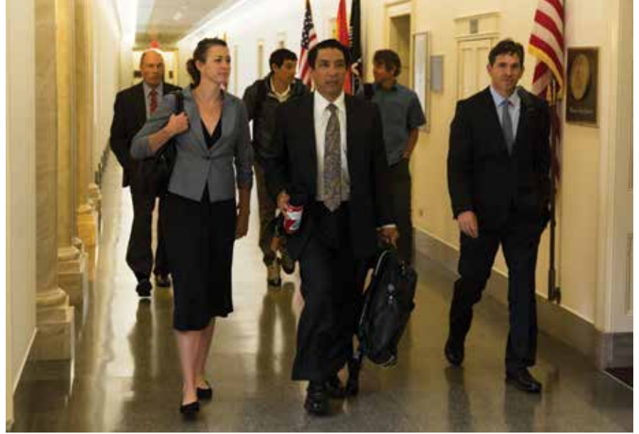
Access Fund team at Climb the Hill event.

A highlight of the trip was an impromptu presentation by former vice-presidential candidate Senator Tim Kaine (D-VA), who expressed