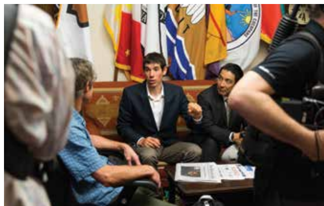
Alex Honnold advocating for climbers at Climb the Hill.

“Anybody who is climbing outdoors has a certain responsibility: to leave no trace, to vote responsibly, to contact their legislators about things that are important to them,” he says. “I don’t think professionals have any more of a responsibility than the average person. But the thing about being a professional is you have a much bigger platform. You’re in a position of greater power. You have the same responsibility as anybody else, but you have a much greater capacity to do good.”