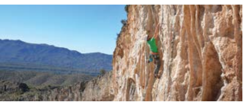
Access Fund purchased a critical access point to the Homestead in central Arizona to save it from indefinite closure. I © Joe Sambataro

Right now, Access Fund has $832,000 out on loan, actively working to secure 10 threatened climbing areas. That leaves the available balance of the loan fund at just under $100,000 for new projects.