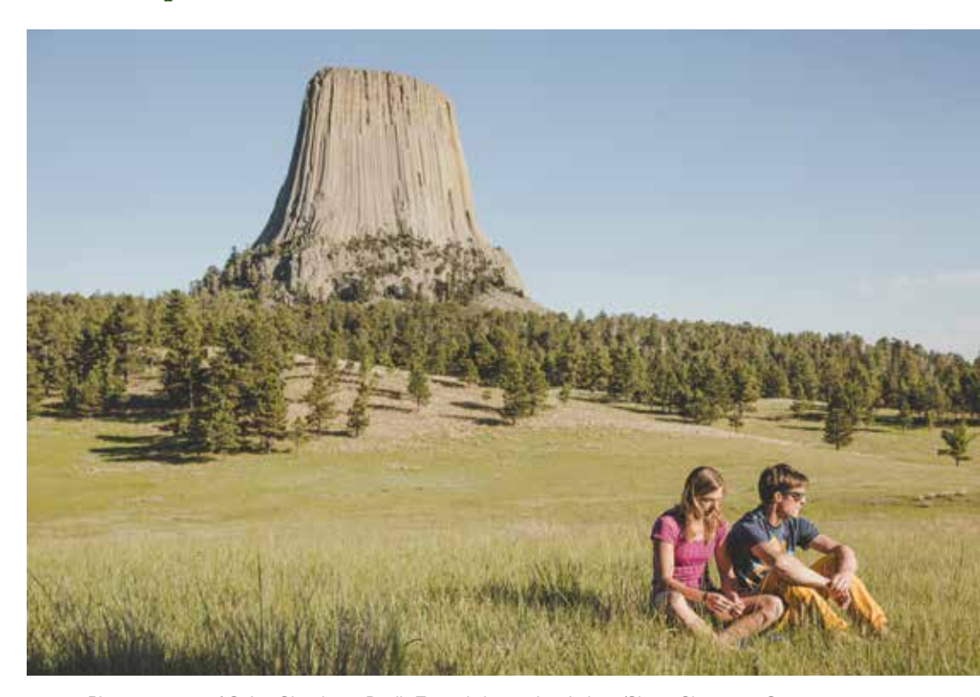
Devils Tower is located on Lakota/Sioux, Cheyenne, Crow, Mandan, Hidatsa, Arikara, Kiowa, Shoshone, and Arapahoe territories.

• Educate yourself. The climbing experience is an amazingly rich one, which is made more so by understanding the human history of the places we climb. Do some research on the indigenous history of your favorite climbing areas, and the next time you're on the approach to your local crag, take a moment to imagine and acknowledge what this place has meant to the hundreds of generations of people who came before us, and what it continues to mean to those who are still there.