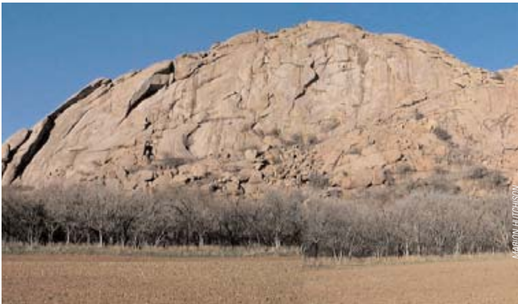
The Access Fund recently helped create the Baldy Point Natural Area, a 60-acre parcel with high quality bouldering on excellent granite in wooded areas. The property is close to Baldy Point (pictured above) , which the AF acquired in 2001 and donated to the State of Oklahoma.