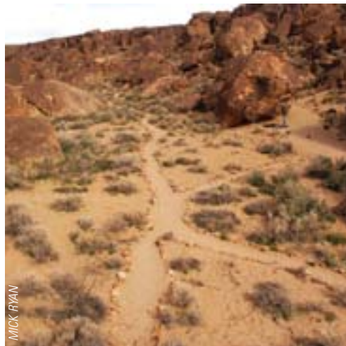
"Happy Trails" abound in Bishop thanks to efforts from local climbers, the BLM, and $9,750 in grants from the Access Fund.