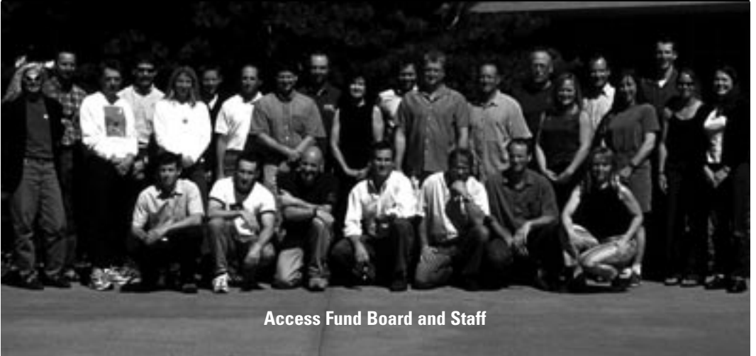
Access Fund Board and Staff